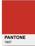
Red R=173 G=25 B=25 C=22 M=100 Y=100 K=15 HTML #ad1919