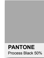
Medium Gray R=153 G=153 B=153 C=0 M=0 Y=0 K=50 HTML #999999