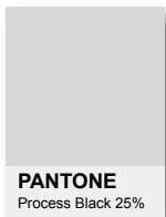
Light Gray R=206 G=206 B=206 C=0 M=0 Y=0 K=25 HTML #cecece