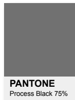
Dark Gray R=94 G=94 B=94 C=0 M=0 Y=0 K=75 HTML #5e5e5e